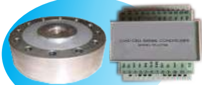
Load Cell + Signal Conditioner