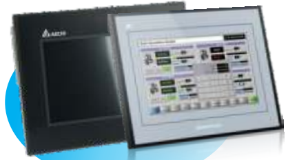
Touch Screen HMI