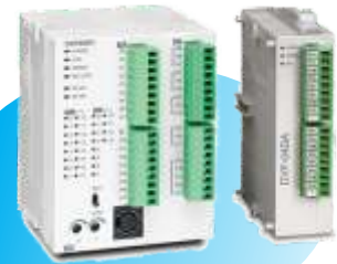
Expandable PLC+ AD Module