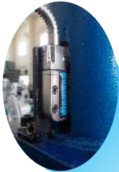
Position Feedback Scale