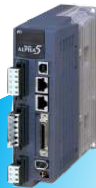
AC Servo amplifier